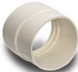
CMCW™ Series Cuff