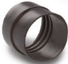
CMCB™ Series Cuff