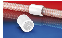
CONNECT 246 FOOD