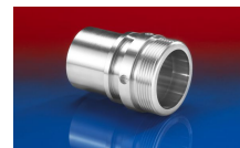
CONNECT THREAD FITTING 234