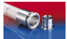
CONNECT PRESS ASSEMBLY 232