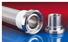
CONNECT MOULD ASSEMBLY 233