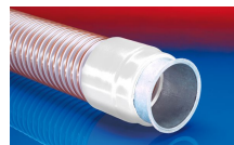
CONNECT 243 FOOD