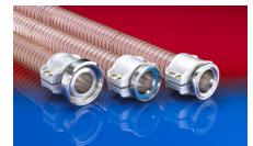
CONNECT SAFETY CLAMP ASSEMBLY 231

Distributed By: plastixs manufacturing solutions