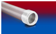
CONNECT 245 FOOD