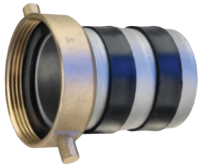
Aluminum Pin Lug Hose Shank with Brass Swivel Nut Female End (NPSM Threads)