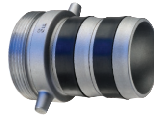
Aluminum Pin Lug Hose Shank Male End (NPSM Threads)