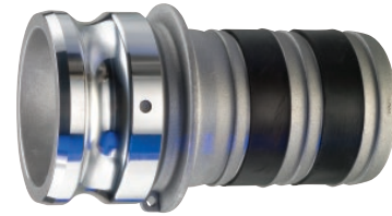
Aluminum Part E Male Adapter x Hose Shank