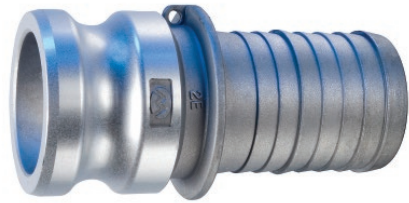
Aluminum Part E Male Adapter x Hose Shank