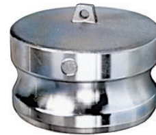
Aluminum Part DP Dust Plug