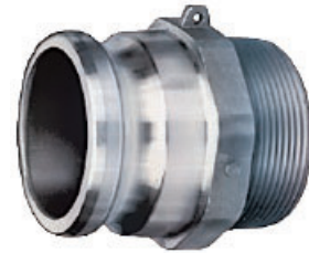
Aluminum Part F Male Adapter x Male NPT