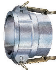
Aluminum Part D Female Coupler x Female NPT