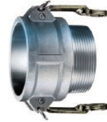
Aluminum Part B Female Coupler x Male NPT