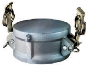
Aluminum Part DC Dust Cap