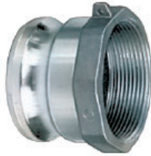
Aluminum Part A Male Adapter x Female NPT