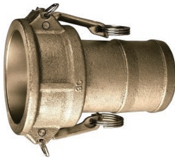
Brass Part C Female Coupler x Hose Shank