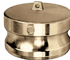
Brass Part DP Dust Plug