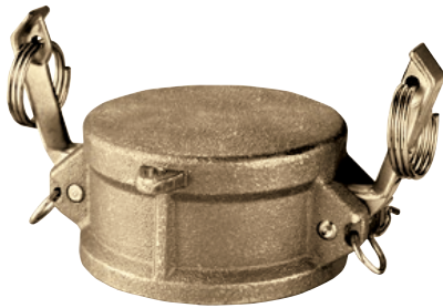
Brass Part DC Dust Cap