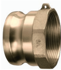
Brass Part A Male Adapter x Female NPT