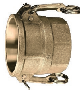
Brass Part D Female Coupler x Female NPT