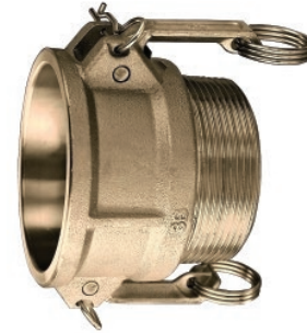
Brass Part B Female Coupler x Male NPT