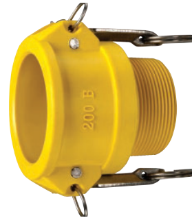
Nylon Part B Female Coupler x Male NPT