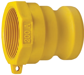
Nylon Part A Male Adapter x Female NPT