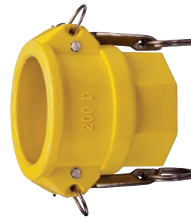
Nylon Part D Female Coupler x Female NPT