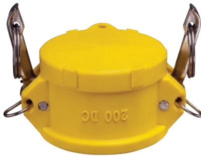
Nylon Part DC Dust Cap