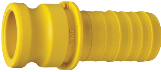
Nylon Part E Male Adapter x Hose Shank