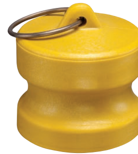
Nylon Part DP Dust Plug