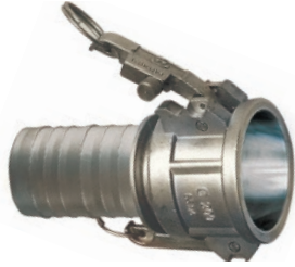
K-Loc™ Part C Female Coupler x Hose Shank