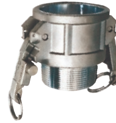
K-Loc™ Part B Female Coupler x Male NPT