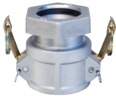
Aluminum Part BC Female Coupler x Compression

Note: Compression Couplings are for attachment to .065" aluminum tubing for dry pneumatic systems only.