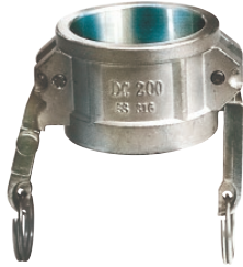
K-Loc™ Part DC Dust Cap