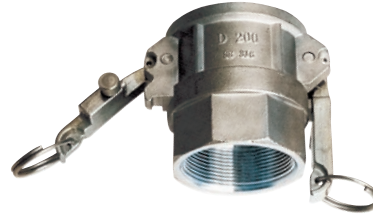
K-Loc™ Part D Female Coupler x Female NPT