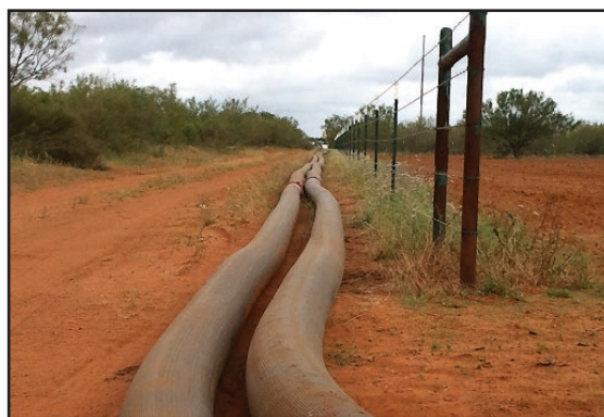
Ideal for water transfer.