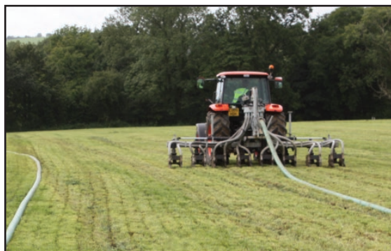
Ideal for drag manure spreading.