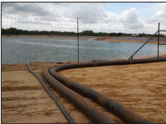
Ideal for water transfer.