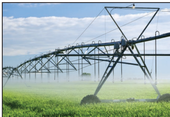
Ideal for traveling irrigators.