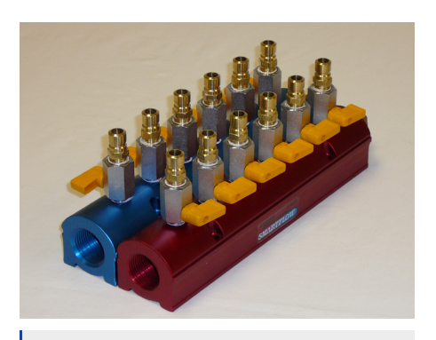
1" Manifold Assemblies with Quick Connects and Chrome Plated Mini Ball Valves