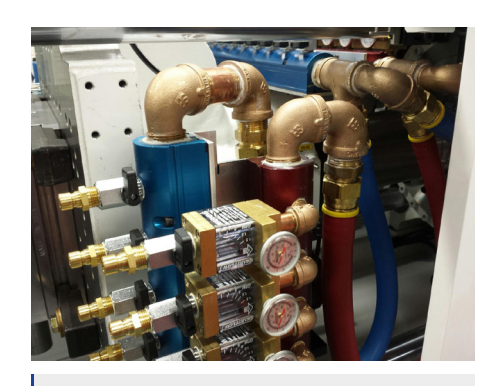
1" Supply/Return Manifold Assemblies with Mechancial Flowmeters, Quick Connects and Brass Ball Valves