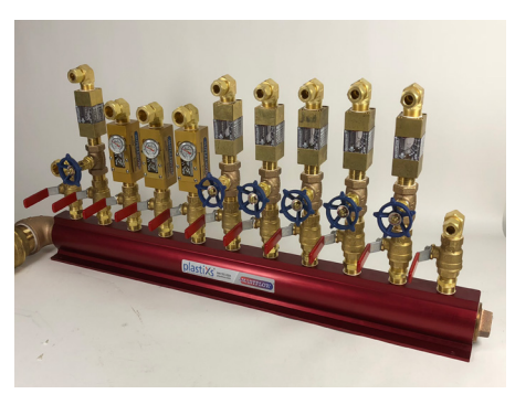
1-1/2" Return Manifold Assembly with Mechanical Flowmeters, 90° Push to Connect Fittings, Brass Ball Valves and Regulating Valves