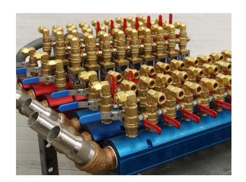
Assemblies with Mechanical Flowmeters, 90° Quick Connects and Brass Ball Valves