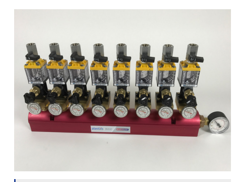
1" Return Manifold Assembly with Delta-Q Flow Regulators, Flowme ters with Temperature Gauges and Chrome Plated Mini Ball Valves