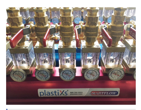
2" Manifold Assemblies with Mechanical Flowmeters, Quick Connects and Brass Ball Valves