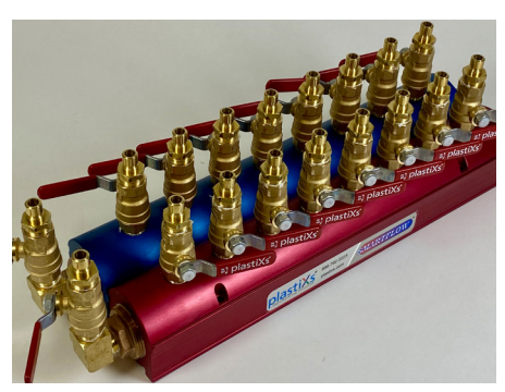
1-1/2" Manifold Assemblies with Quick Connects, Brass Ball Valves and Valves Added for Purging