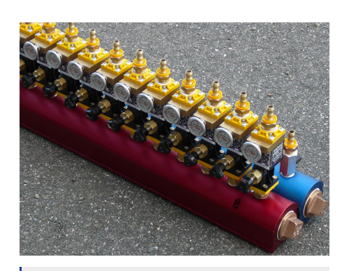
1-1/2" Manifold Assemblies with Delta-Q Flow Regulators, Flowme ters with Temperature Gauges and Ouick Connects