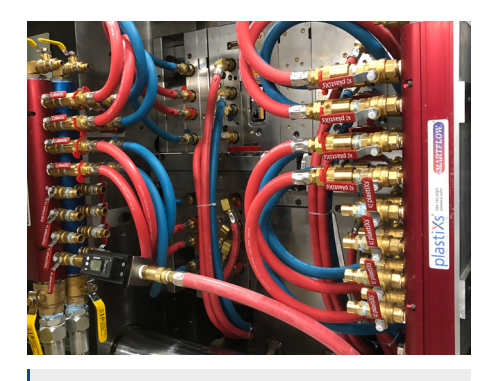
1-1/2" Manifold Assemblies with Quick Connects, Brass Ball Valves and HiTemp EPDM Hose