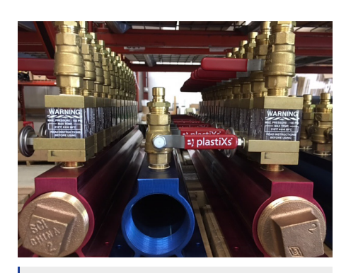
2" Manifold Assemblies with Mechancial Flowmeters, Quick Connects and Brass Ball Valves