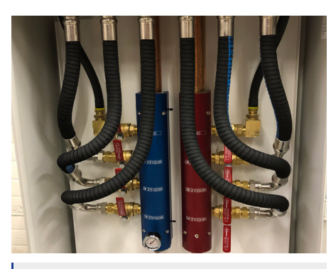
1-1/2" Manifold Assemblies Mounted in a Control Cabinet with Brass Ball Valves and Custom Hose Assemblies