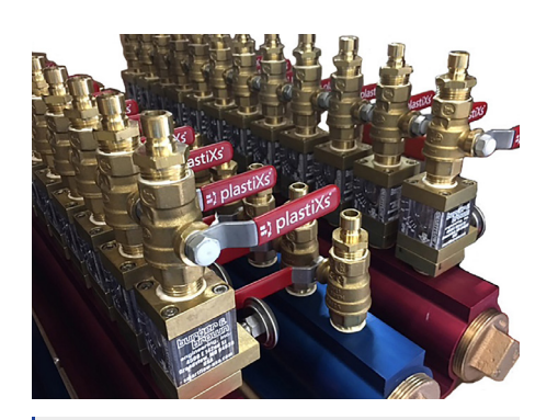
2" Manifold Assemblies with Mechanical Flowmeters, Quick Connects and Brass Ball Valves