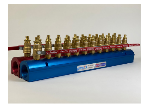
1-1/2" Manifold Assemblies with Quick Connects, Brass Ball Valves and Brass Nipples