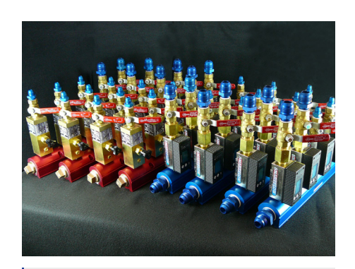
1" Manifold Assemblies with Brass Flow Regulators, Tracer Electronic Flowmeters, Quick Connects and Brass Ball Valves