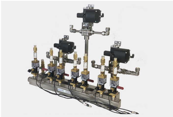
Supply and return manifolds, featuring flow sensing and regulation on return side and 3-way electronic valves on the supply side

How accessible will the manifolds be? Will operators be able to reach valves or view the flow meters easily? If not, consider linking the valves so they operate together and using an electronic flow meter with a display that can be moved to a remote location.